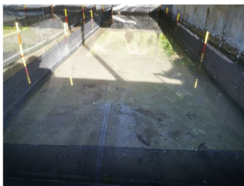
Figure 1. The Netlon cage used for this experiment (8 m \times 2 m)

This study was conducted in a concrete nursery tank with a total area of a tank of 100 \text{m}^2 (10 m \times 10 m) and a total volume of water of 40 tonnes. Netlon cage was set up in a tank with a total area of 16 \text{m}^2 (8 m \times 2 m), where it was covered with marine sediment from the finest sediment and mud at a ratio of 50:50 at the bottom of the tank at 20 cm depth (Figure 1). The total height of the cage is 60 cm; 20 cm of the wall cage was planted at the bottom of the tank. The tank was covered with a 70% sunshade net.